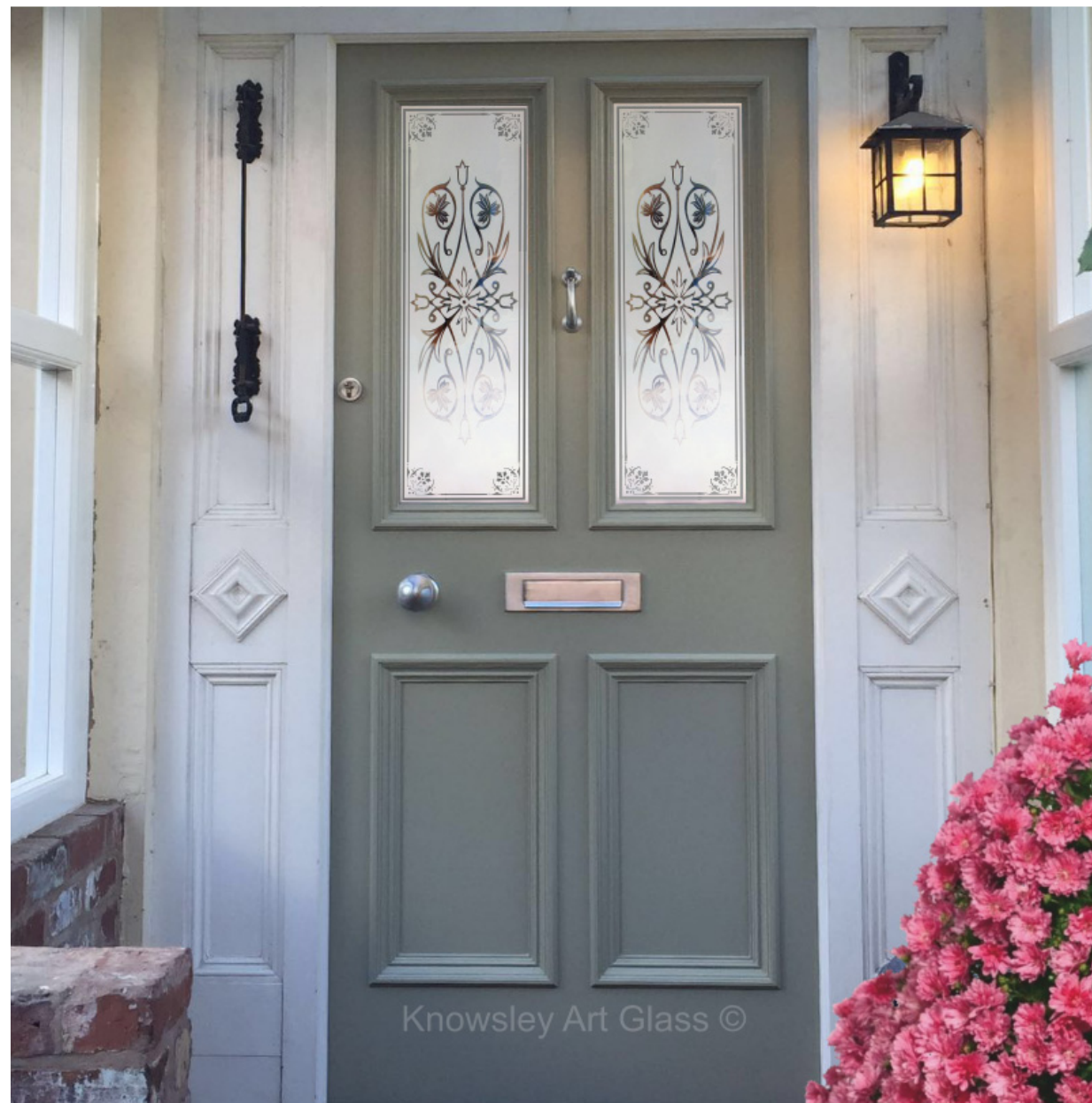
DOOR REF- BESP08 | GLASS REF- DEP30/C8 PRICE ON APPLICATION.