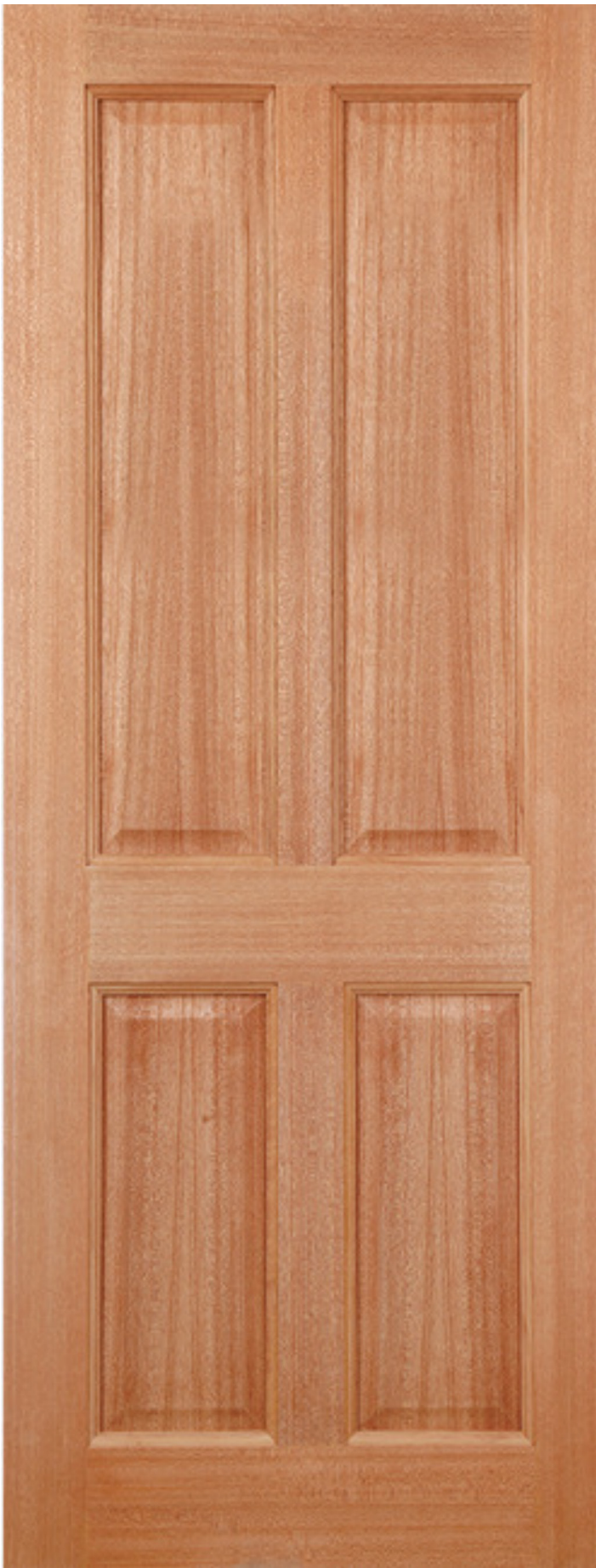
COLONIAL FOUR PANEL