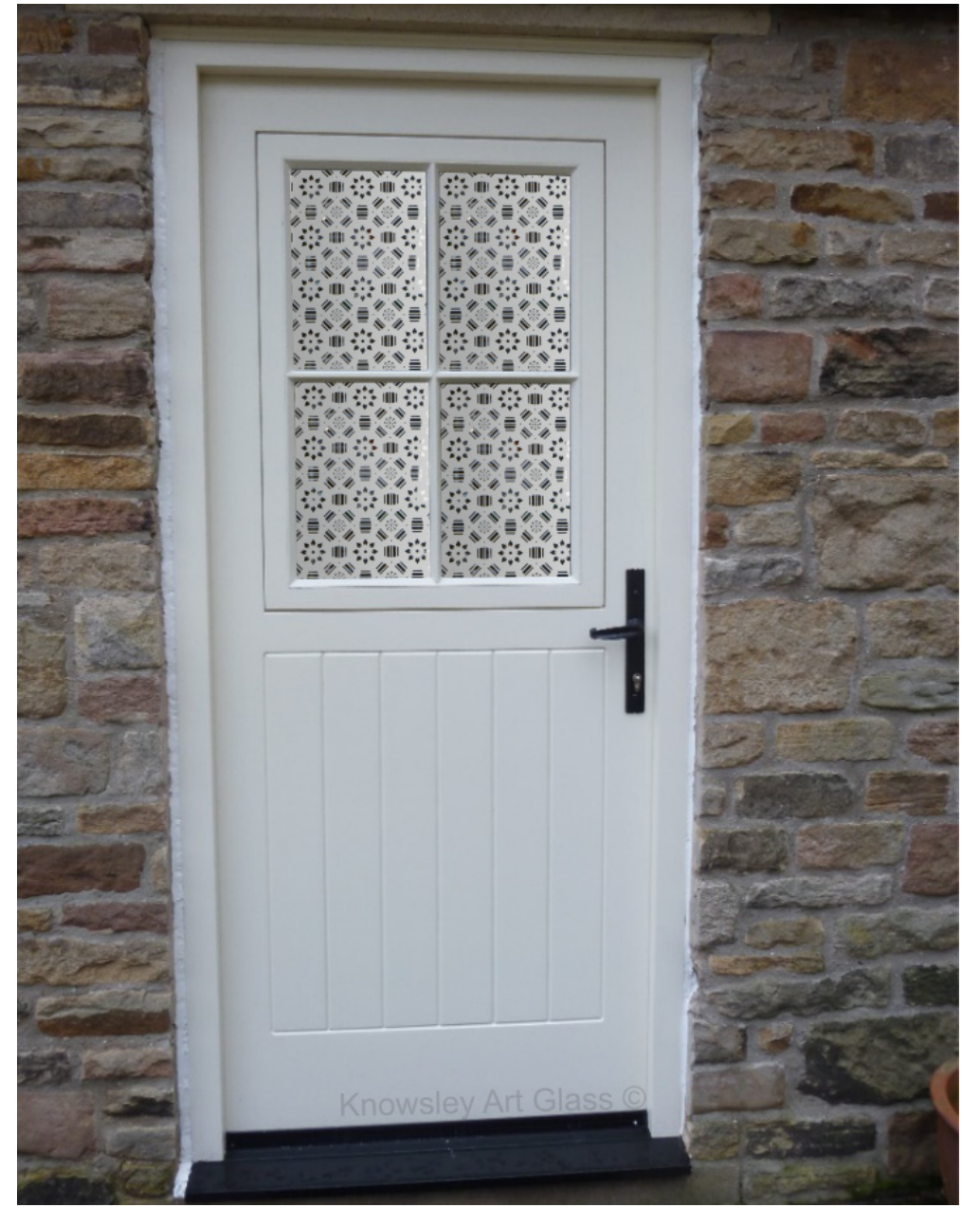
DOOR REF- BESP13 | GLASS REF- GEM PRICE ON APPLICATION.