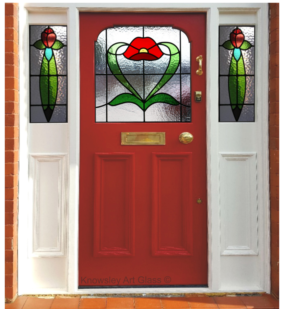
DOOR REF- BESP15 | GLASS REF- ARTNUV01 PRICE ON APPLICATION.