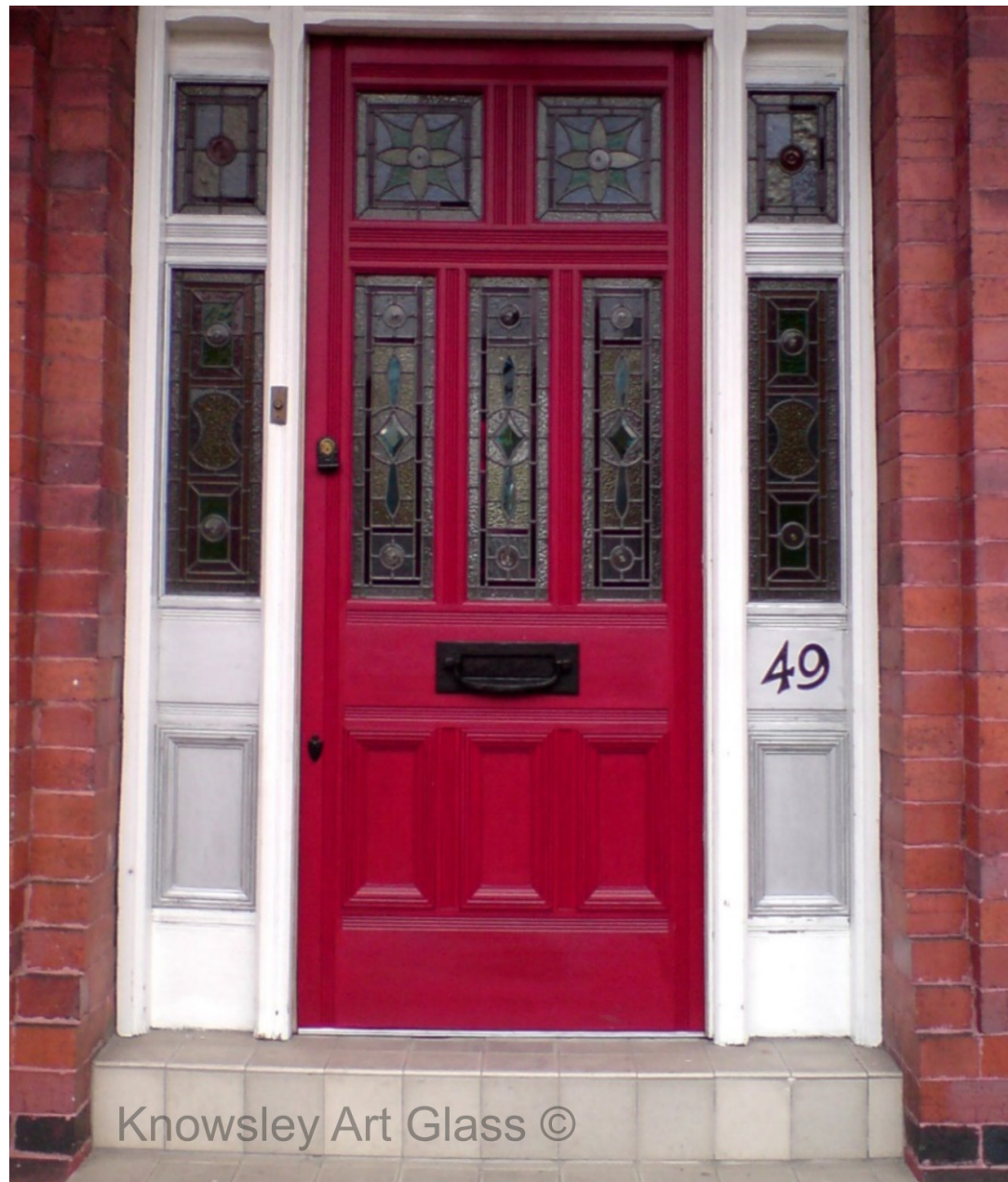
DOOR REF- BESP07 | GLASS REF- BESPGE01 PRICE ON APPLICATION.