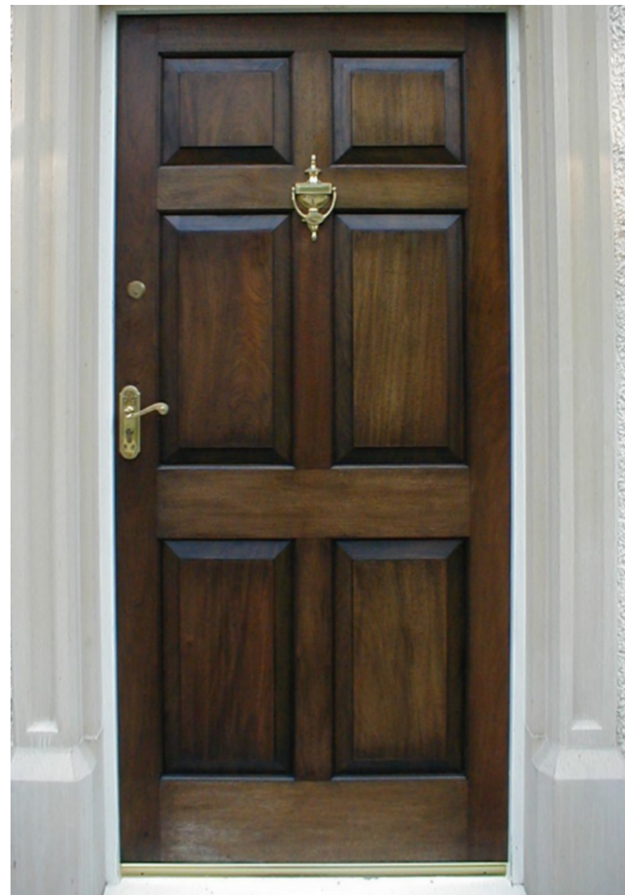
DOOR REF- BESP17 | PRICE ON APPLICATION.