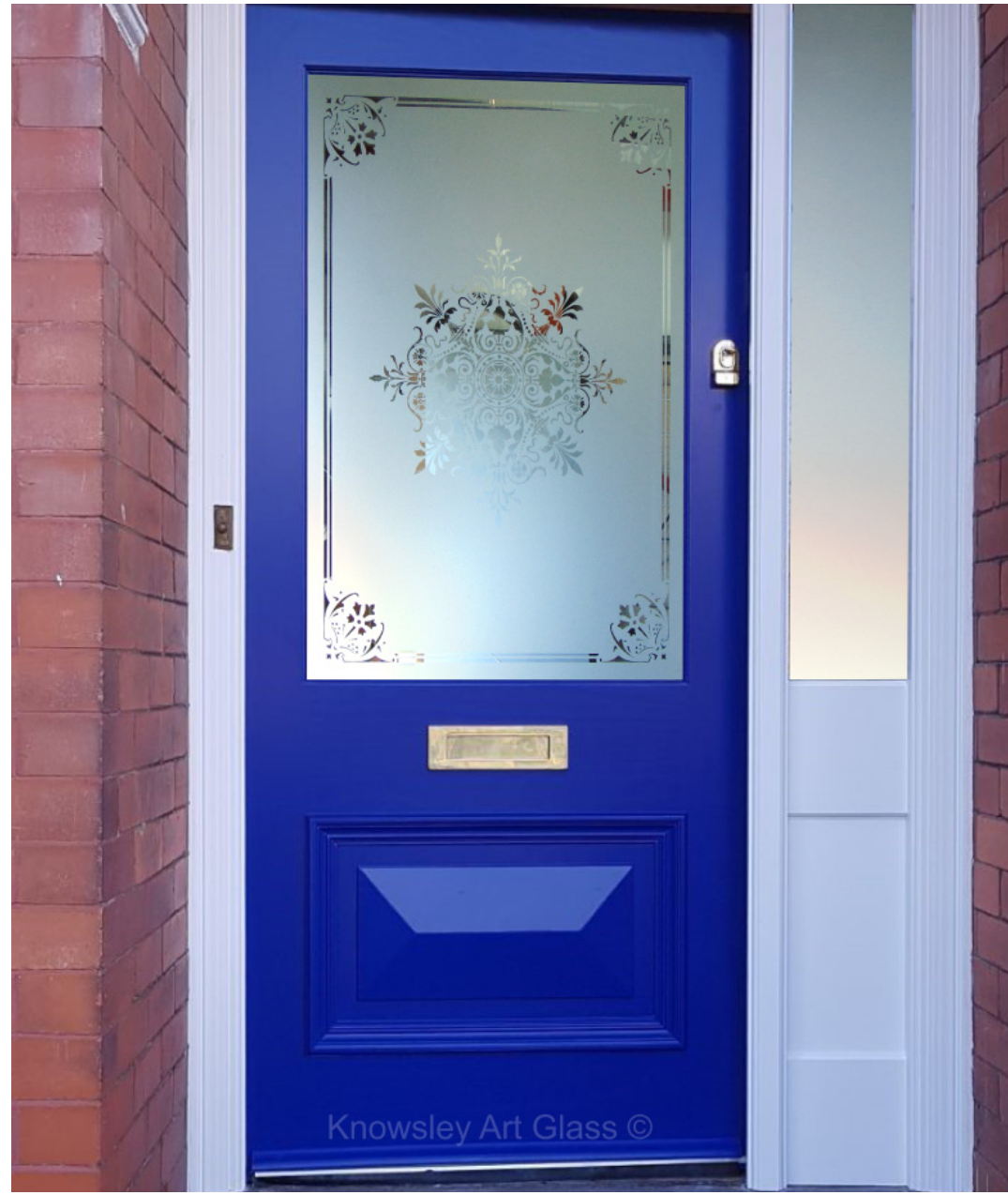
DOOR REF- BESP11 | GLASS REF- DEP34/C8 PRICE ON APPLICATION.