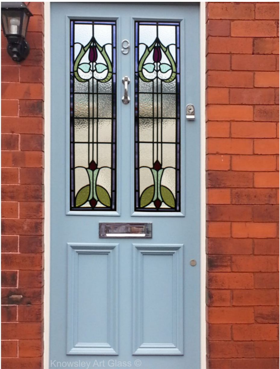
DOOR REF- BSP03 | GLASS REF- STAINED TULIP PRICE ON APPLICATION.