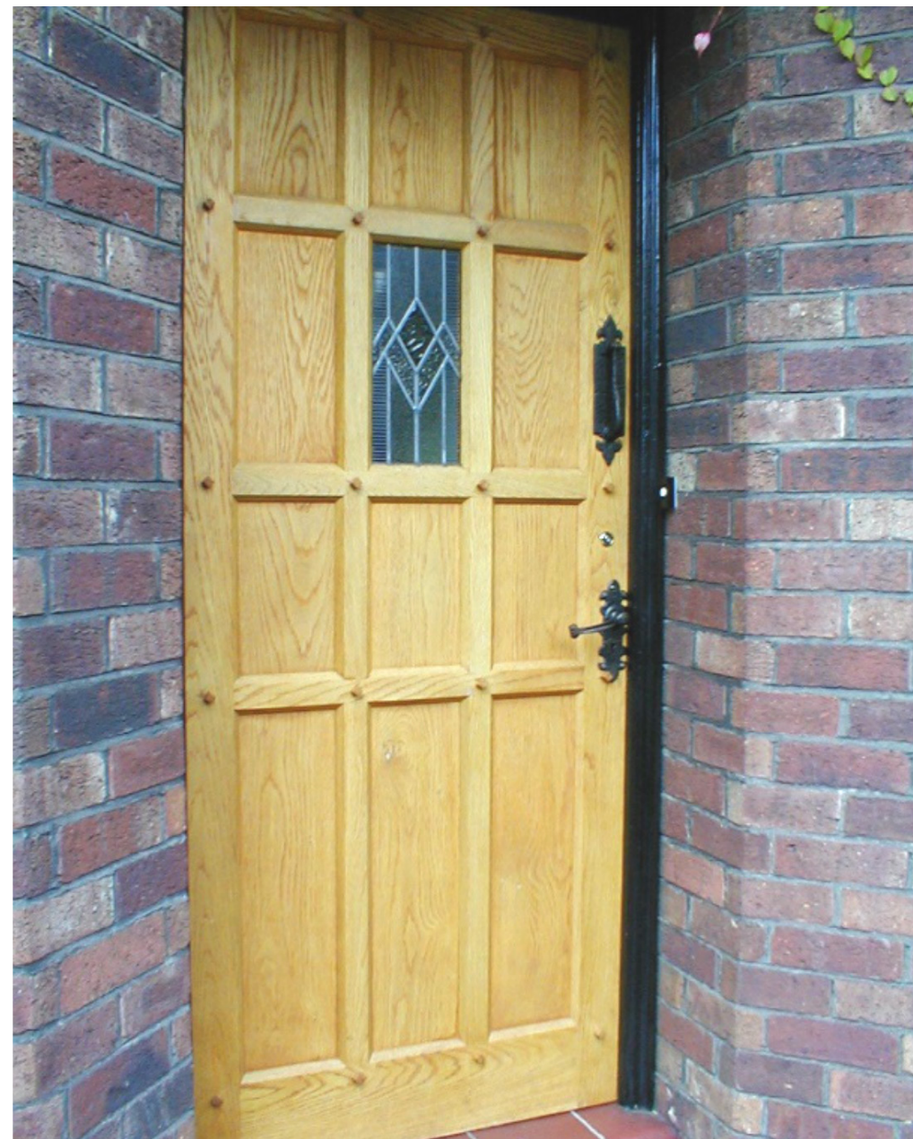
DOOR REF- BESP18 | GLASS REF- ARNOV02 PRICE ON APPLICATION.