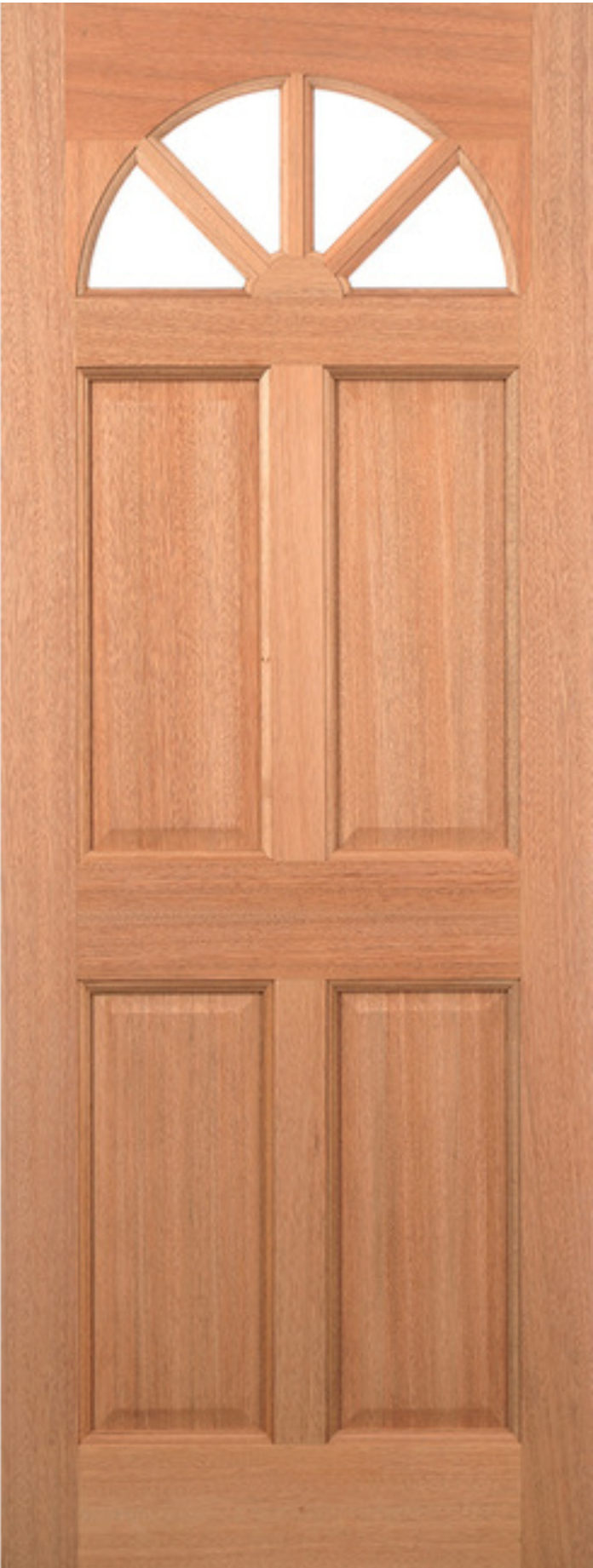
CAROLINA FOUR PANEL

OUR STERLING HARDWOOD EXTERNAL DOORS ARE UNFINISHED AND UNGLAZED, ALL DOORS ARE 44MM THICK AND CAN BE FITTED WITH 14MM DOUBLE GLAZED UNITS WHERE APPLICABLE.