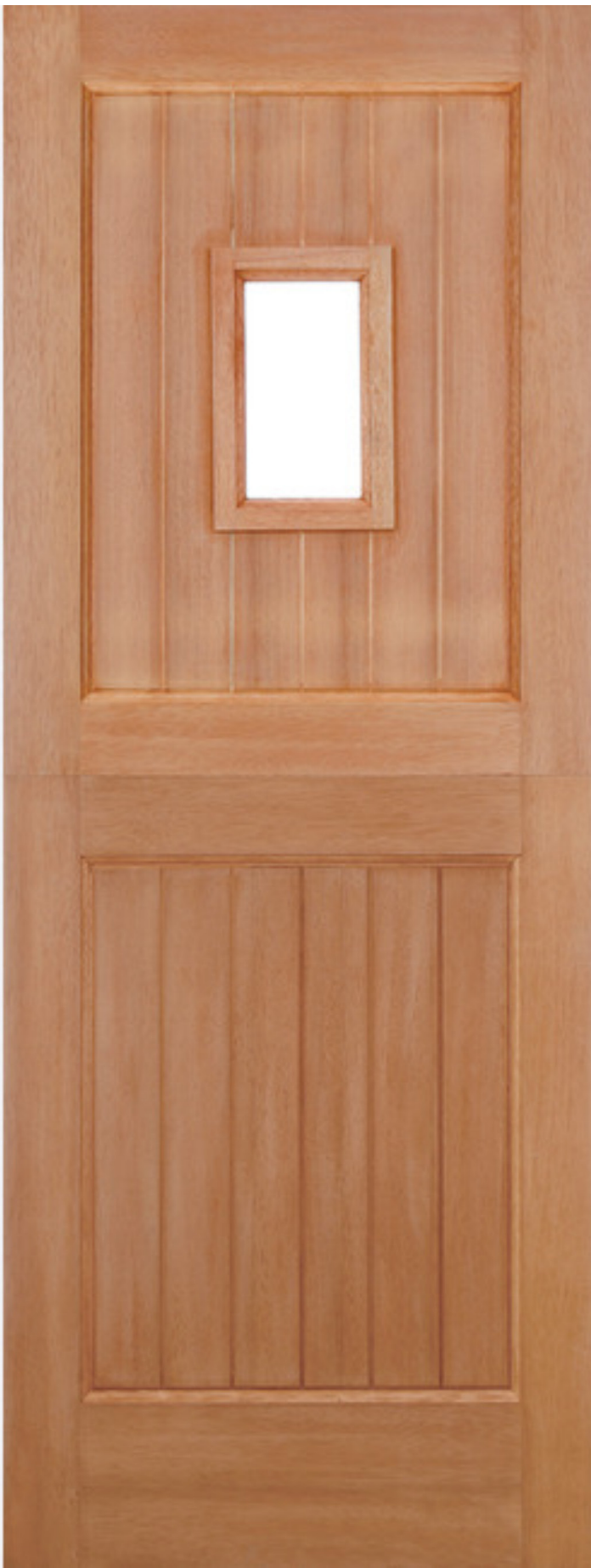
STABLE STRAIGHT TOP