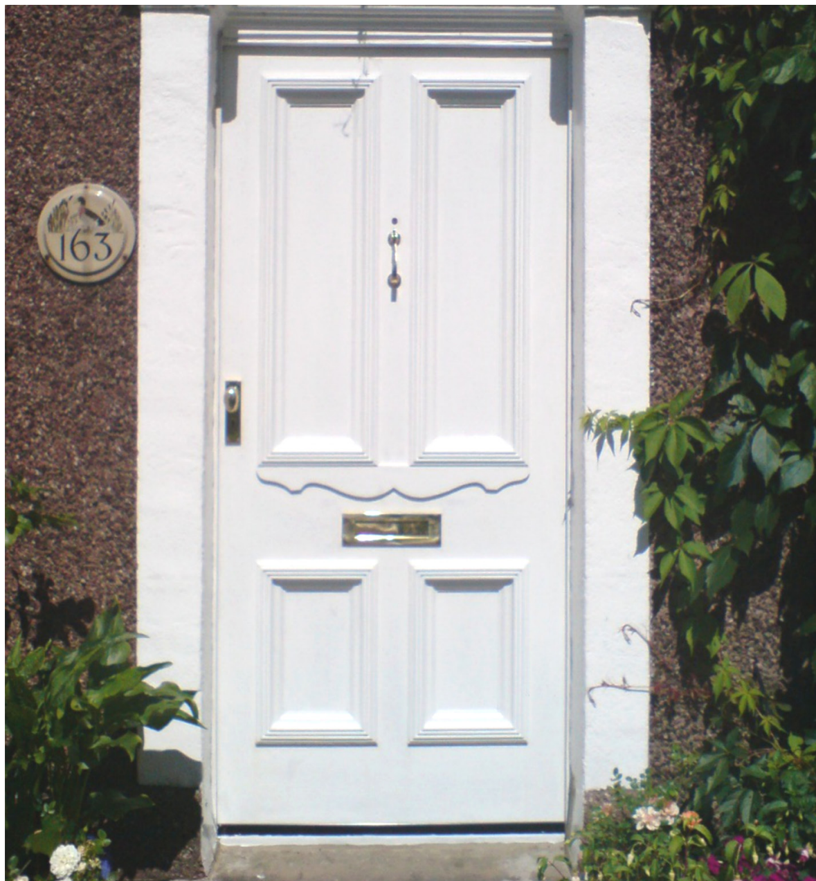
DOOR REF- BESP16 | GLASS REF- BESP16 PRICE ON APPLICATION.