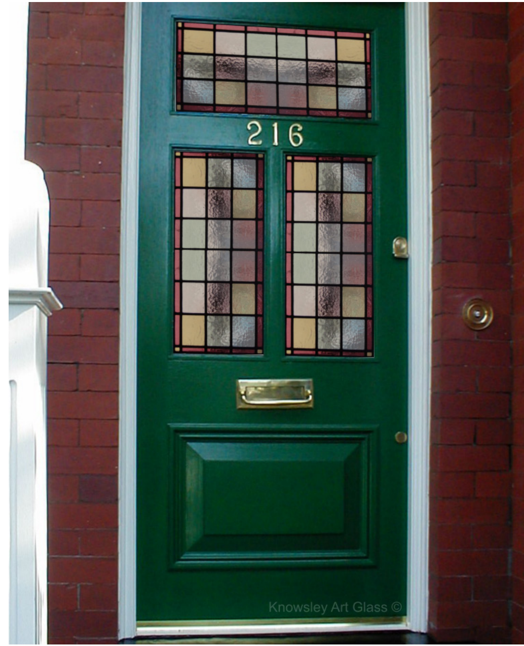
DOOR REF- BESP12 | GLASS REF- P01L01 PRICE ON APPLICATION.