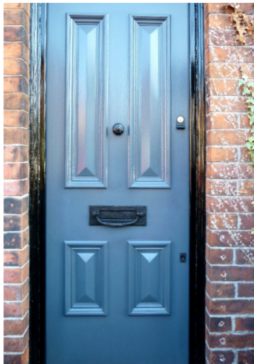
DOOR REF- BESP19 | PRICE ON APPLICATION.