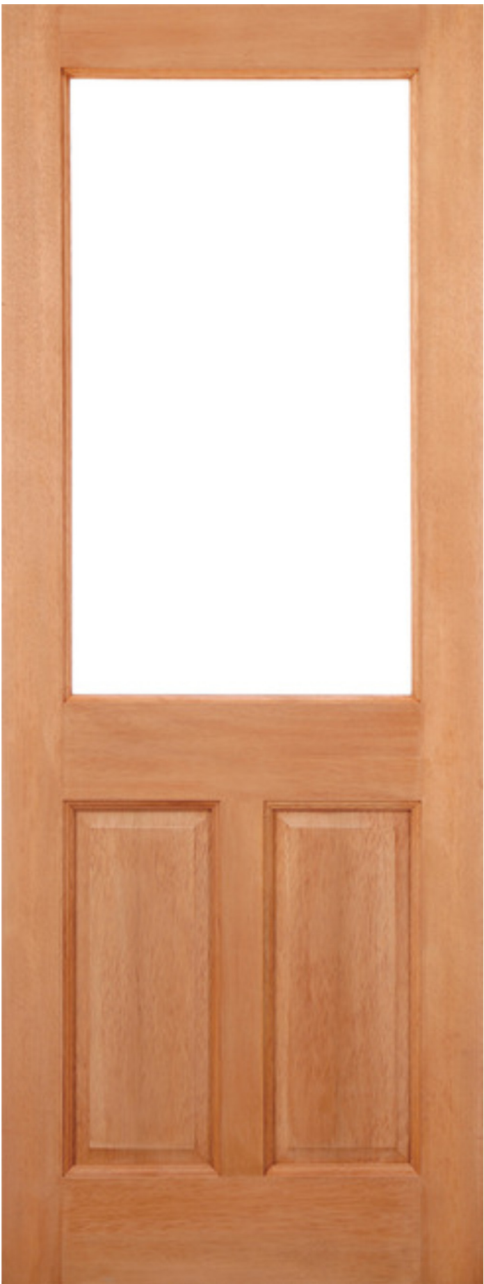
2XG 2 PANEL