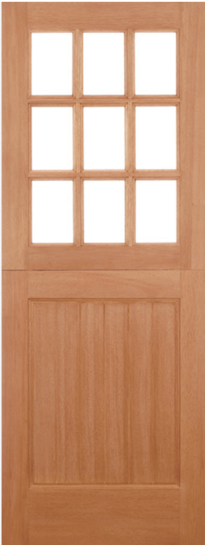
STABLE 9L STRAIGHT