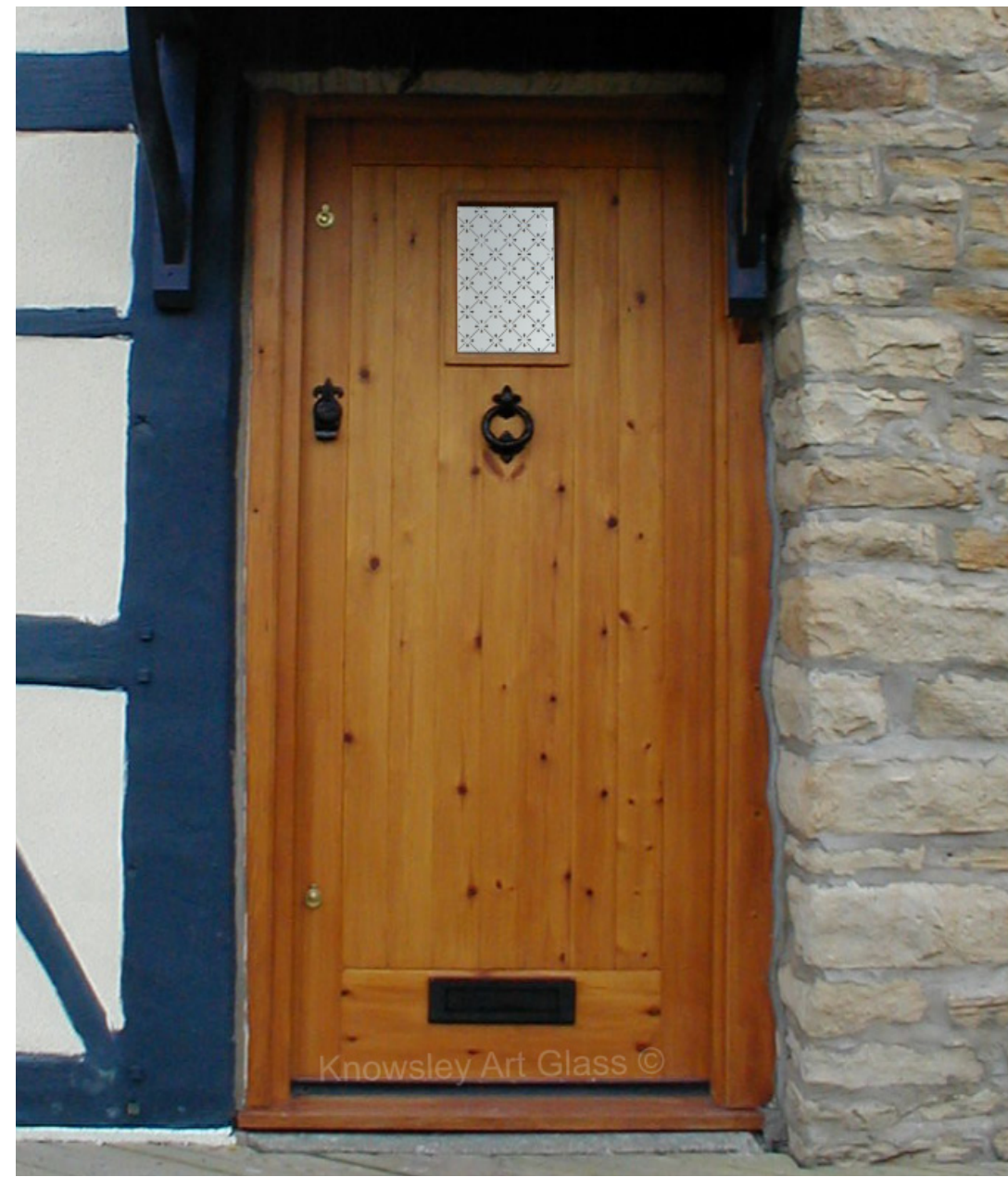
DOOR REF- BESP14 | GLASS REF- FLEUR PRICE ON APPLICATION.