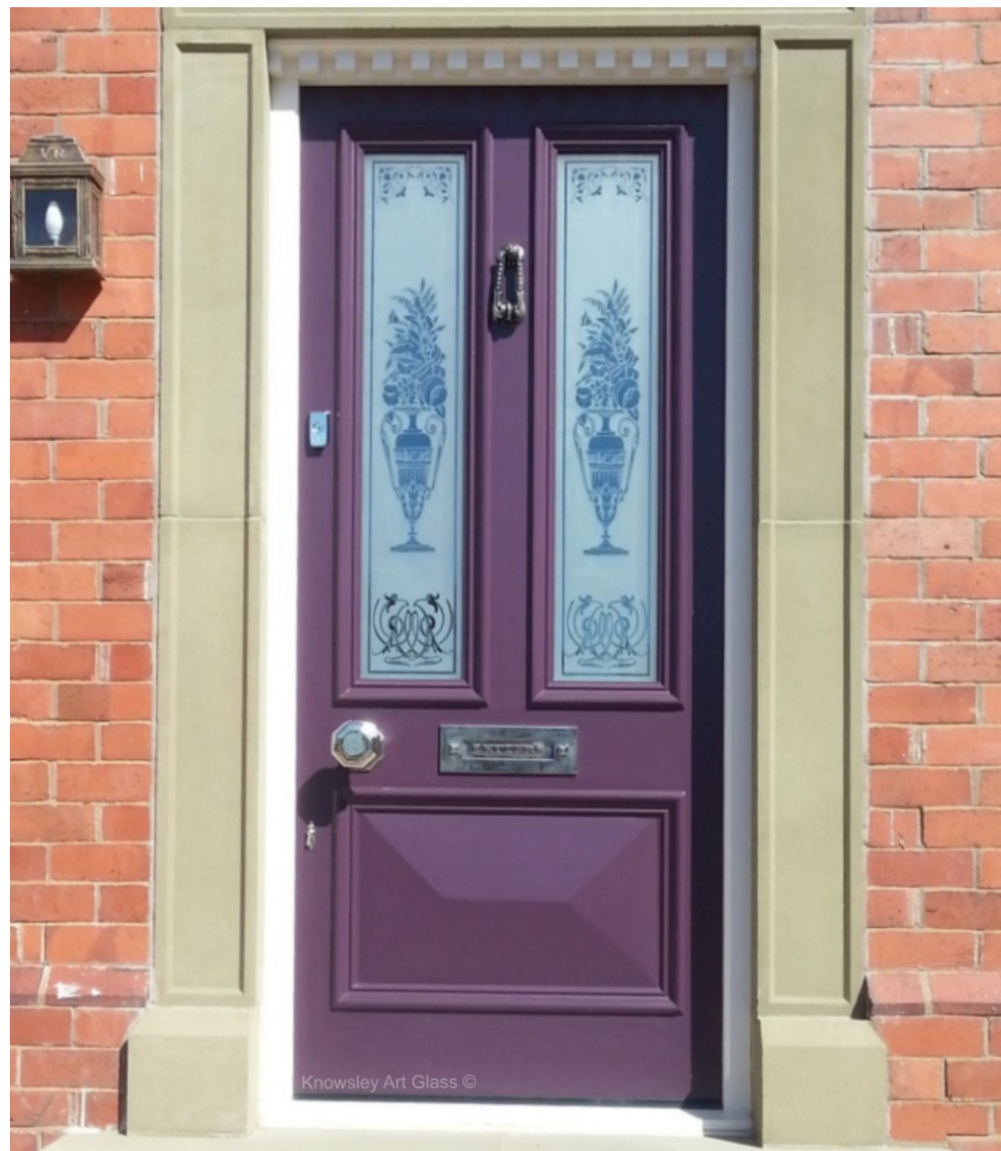
DOOR REF- BESP06 | GLASS REF- P31 PRICE ON APPLICATION.