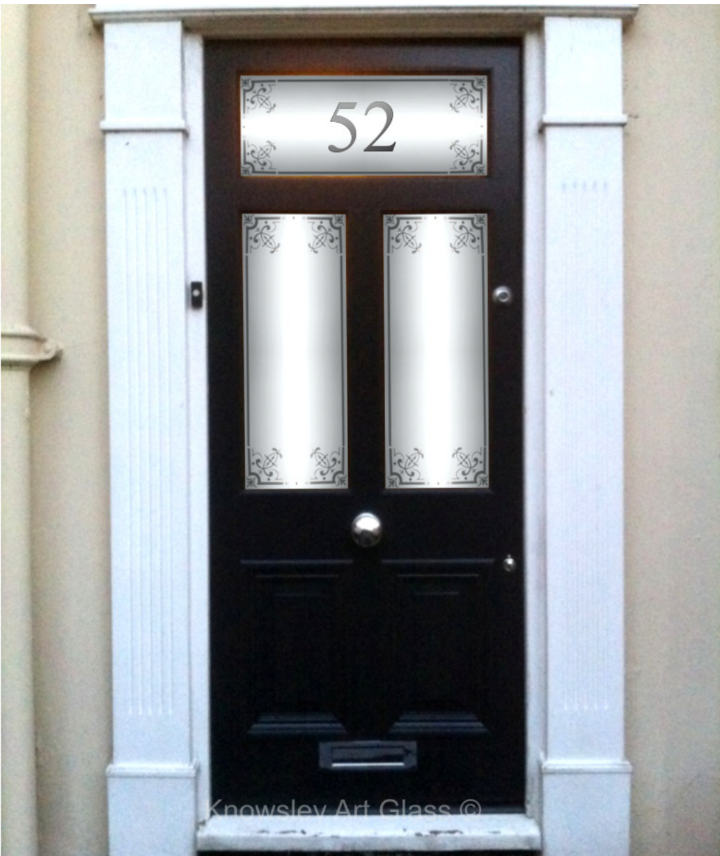
DOOR REF- BSP02 | GLASS REF- C14BORDERS PRICE ON APPLICATION.