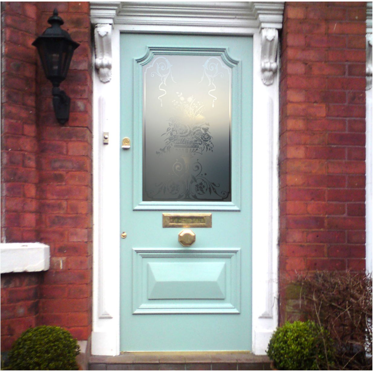
DOOR REF- BSP01 | GLASS REF- DEP35 PRICE ON APPLICATION.